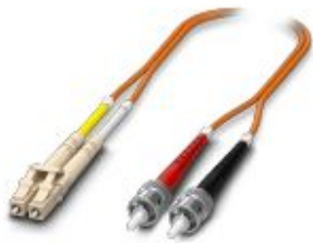
Multi-mode OM1 duplex jumper, LC-ST, UPC polishing, length 2 m

Please be informed that the data shown in this PDF Document is generated from our Online Catalog. Please find the complete data in the user's documentation. Our General Terms of Use for Downloads are valid ( http://phoenixcontact.com/download )