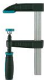
PPS COMPACT clamp for attaching the PPS COMPACT profile cutter, steel spindle with trapezoidal thread and plastic handle

Please be informed that the data shown in this PDF Document is generated from our Online Catalog. Please find the complete data in the user's documentation. Our General Terms of Use for Downloads are valid ( http://phoenixcontact.com/download )