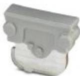
Feed-through connector, length: 10.5 mm, width: 4 mm, color: gray

Feed-through connector - P-FIX - 3038956