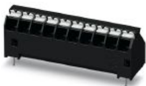
The figure shows the 10-position version

PCB terminal block, nominal current: 13.5 A, rated voltage (III/2): 160 V, nominal cross section: 1.5 mm 2 , pitch: 3.81 mm, number of positions: 6, connection method: Push-in spring connection, mounting: THR soldering, conductor/PCB connection direction: 45 °, color: black, Solder pin [P]: 2.6 mm