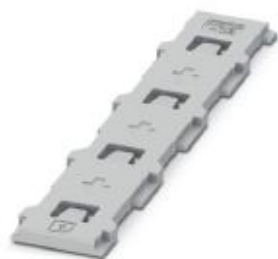
ME-IO Blockbelt, for 4 PCB connectors, color: light gray (7035)

Please be informed that the data shown in this PDF Document is generated from our Online Catalog. Please find the complete data in the user's documentation. Our General Terms of Use for Downloads are valid ( http://phoenixcontact.com/download )