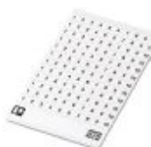
Marker card, Card, can be ordered: by card, white, labeled according to customer specifications, mounting type: adhesive, for terminal block width: 4.15 mm, lettering field size: continuous x 3.8#mm

Marker card - SK 3,8 REEL P4,15 WH CUS - 0825990