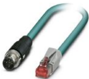
Network cable, Ethernet CAT5, 4-position, shielded, Plug straight M12 / IP67, coding: D, on Plug straight RJ45 / IP20, cable length: 2 m

Please be informed that the data shown in this PDF Document is generated from our Online Catalog. Please find the complete data in the user's documentation. Our General Terms of Use for Downloads are valid ( http://phoenixcontact.com/download )