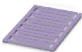
The figure shows an unlabeled version in white

Please be informed that the data shown in this PDF Document is generated from our Online Catalog. Please find the complete data in the user's documentation. Our General Terms of Use for Downloads are valid ( http://phoenixcontact.com/download )