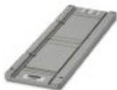
Magazine, for CMS-P1-PLOTTER and PLOTMARK, for accommodating UC-TMF..., UC1-TMF..., UC-WMT...