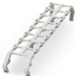
Marker for terminal blocks, white, labeled, mounting type: snapped, for terminal block width: 8 mm, lettering field size: 2,4x 9,2 mm

Please be informed that the data shown in this PDF Document is generated from our Online Catalog. Please find the complete data in the user's documentation. Our General Terms of Use for Downloads are valid ( http://phoenixcontact.com/download )