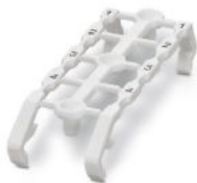
Marker for terminal blocks, white, labeled, mounting type: snapped, for terminal block width: 4 mm, lettering field size: 2,4x 9,2 mm

Please be informed that the data shown in this PDF Document is generated from our Online Catalog. Please find the complete data in the user's documentation. Our General Terms of Use for Downloads are valid ( http://phoenixcontact.com/download )