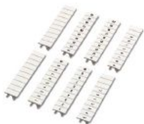
Zack marker strip, 10-section, vertically labeled with the consecutive numbers: 431 ... 440, white, width: 5 mm

Please be informed that the data shown in this PDF Document is generated from our Online Catalog. Please find the complete data in the user's documentation. Our General Terms of Use for Downloads are valid ( http://phoenixcontact.com/download )