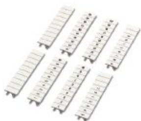
Zack marker strip, 10-section, vertically labeled with the consecutive numbers: 411 ... 420, white, width: 5 mm

Please be informed that the data shown in this PDF Document is generated from our Online Catalog. Please find the complete data in the user's documentation. Our General Terms of Use for Downloads are valid ( http://phoenixcontact.com/download )