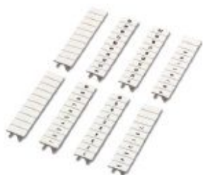
Zack marker strip, 10-section, vertically labeled with the consecutive numbers: 351 ... 360, white, width: 5 mm

Please be informed that the data shown in this PDF Document is generated from our Online Catalog. Please find the complete data in the user's documentation. Our General Terms of Use for Downloads are valid ( http://phoenixcontact.com/download )