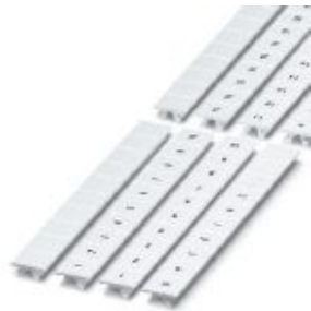
Zack marker strip, 10-section, horizontally labeled with the identical number: 78, white

Please be informed that the data shown in this PDF Document is generated from our Online Catalog. Please find the complete data in the user's documentation. Our General Terms of Use for Downloads are valid ( http://phoenixcontact.com/download )