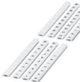
Zack marker strip, 10-section, horizontally labeled with the consecutive numbers: 61 ... 70, white

Please be informed that the data shown in this PDF Document is generated from our Online Catalog. Please find the complete data in the user's documentation. Our General Terms of Use for Downloads are valid ( http://phoenixcontact.com/download )