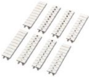
Zack marker strip, 10-section, horizontally labeled with the consecutive even numbers: 42 ... 60, white, width: 5 mm

Please be informed that the data shown in this PDF Document is generated from our Online Catalog. Please find the complete data in the user's documentation. Our General Terms of Use for Downloads are valid ( http://phoenixcontact.com/download )