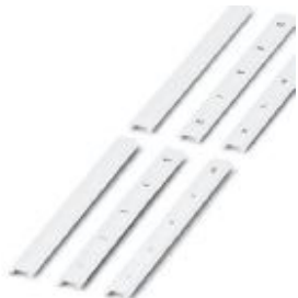
Zack marker strip, 10-section, vertically labeled with the consecutive numbers: 21 ... 30, white

Please be informed that the data shown in this PDF Document is generated from our Online Catalog. Please find the complete data in the user's documentation. Our General Terms of Use for Downloads are valid ( http://phoenixcontact.com/download )