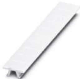
Zack marker strip, 10-section, horizontally labeled with the identical number: 13, white, width: 6 mm

Please be informed that the data shown in this PDF Document is generated from our Online Catalog. Please find the complete data in the user's documentation. Our General Terms of Use for Downloads are valid ( http://phoenixcontact.com/download )