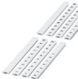
Zack marker strip, 10-section, horizontally labeled with the consecutive numbers: 11 ... 20, white

Please be informed that the data shown in this PDF Document is generated from our Online Catalog. Please find the complete data in the user's documentation. Our General Terms of Use for Downloads are valid ( http://phoenixcontact.com/download )