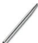
Alignment tool for cable markers, Bare metallic, mounting type: thread on, cable diameter range: 2.5 ... 16 mm

Alignment tool for cable markers - SD-WMS 5 TOOL - 0826475