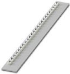
Marking material, white, pre-printed: V, mounting type: insert

Please be informed that the data shown in this PDF Document is generated from our Online Catalog. Please find the complete data in the user's documentation. Our General Terms of Use for Downloads are valid ( http://phoenixcontact.com/download )