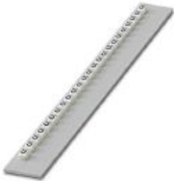
Marking material, white, pre-printed: S, mounting type: insert

Please be informed that the data shown in this PDF Document is generated from our Online Catalog. Please find the complete data in the user's documentation. Our General Terms of Use for Downloads are valid ( http://phoenixcontact.com/download )