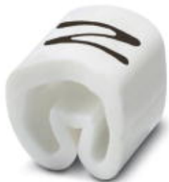
Conductor marking collar, labeled with the capital letter: Letters, white, width: 3.2 mm

Please be informed that the data shown in this PDF Document is generated from our Online Catalog. Please find the complete data in the user's documentation. Our General Terms of Use for Downloads are valid ( http://phoenixcontact.com/download )