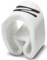
Conductor marking collar, labeled with the capital letter: Letters, white, width: 3.2 mm

Please be informed that the data shown in this PDF Document is generated from our Online Catalog. Please find the complete data in the user's documentation. Our General Terms of Use for Downloads are valid ( http://phoenixcontact.com/download )