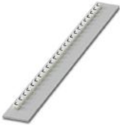
Marking material, white, pre-printed: L, mounting type: insert

Please be informed that the data shown in this PDF Document is generated from our Online Catalog. Please find the complete data in the user's documentation. Our General Terms of Use for Downloads are valid ( http://phoenixcontact.com/download )