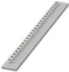
Marking material, white, pre-printed: K, mounting type: insert

Please be informed that the data shown in this PDF Document is generated from our Online Catalog. Please find the complete data in the user's documentation. Our General Terms of Use for Downloads are valid ( http://phoenixcontact.com/download )