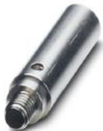
Female test connector, for 4 mm test plugs, for screwing into the bridge shaft, color: silver

Please be informed that the data shown in this PDF Document is generated from our Online Catalog. Please find the complete data in the user's documentation. Our General Terms of Use for Downloads are valid ( http://phoenixcontact.com/download )