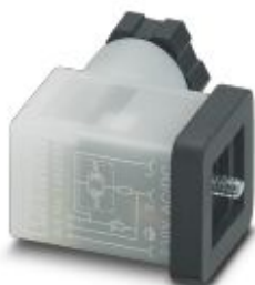
Valve connectors, Universal, 3-position, Valve connector CI (9.4 mm), with 1 LED, connected with Varistor, Screw connection, cable gland M12, external cable diameter 4 mm ... 6 mm

Please be informed that the data shown in this PDF Document is generated from our Online Catalog. Please find the complete data in the user's documentation. Our General Terms of Use for Downloads are valid ( http://phoenixcontact.com/download )