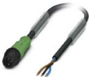
Sensor/actuator cable, 3-position, PUR halogen-free, black-gray RAL 7021, Plug straight M12, coding: A, on free cable end, cable length: 5 m, with plastic knurl

Please be informed that the data shown in this PDF Document is generated from our Online Catalog. Please find the complete data in the user's documentation. Our General Terms of Use for Downloads are valid ( http://phoenixcontact.com/download )