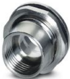
Housing screw connection with M12 standard thread, with O-ring, for 2-piece K, L, and M-coded THR contact carriers

Please be informed that the data shown in this PDF Document is generated from our Online Catalog. Please find the complete data in the user's documentation. Our General Terms of Use for Downloads are valid ( http://phoenixcontact.com/download )