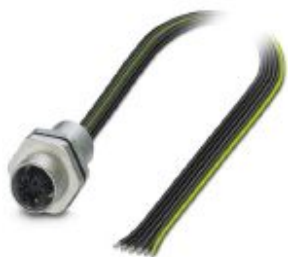
Flush-type connector, Power, 6-position, Socket, M12, M - Power, Front mounting, M16 x 1.5, Individual wires, cable length: 0.2 m, 1.31 mm 2 , UL/cUL stranded hook-up wire

Please be informed that the data shown in this PDF Document is generated from our Online Catalog. Please find the complete data in the user's documentation. Our General Terms of Use for Downloads are valid ( http://phoenixcontact.com/download )