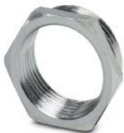
Reducing adapter, material: Brass, nickel-plated, connecting thread: Pg16, color: silver, with O-ring

Please be informed that the data shown in this PDF Document is generated from our Online Catalog. Please find the complete data in the user's documentation. Our General Terms of Use for Downloads are valid ( http://phoenixcontact.com/download )