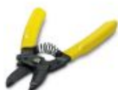
Fiber stripper for AWG 22 - 10 / (0.6 ... 2.6 mm)

FO accessories - FOC-TOOL-STRIPPING-FA-2 - 1414100