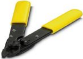
2-hole fiber stripper

Please be informed that the data shown in this PDF Document is generated from our Online Catalog. Please find the complete data in the user's documentation. Our General Terms of Use for Downloads are valid ( http://phoenixcontact.com/download )