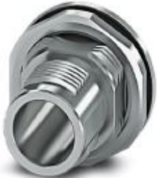
M12 SPEEDCON housing screw connection for M12 male inserts, with O-ring, for all SPEEDCON-capable THR and wave soldering contact carriers

Please be informed that the data shown in this PDF Document is generated from our Online Catalog. Please find the complete data in the user's documentation. Our General Terms of Use for Downloads are valid ( http://phoenixcontact.com/download )