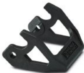
Double locking latch for B10 / B16 / B24 housing, HC-EVO....AL and HC-STA....AL

Please be informed that the data shown in this PDF Document is generated from our Online Catalog. Please find the complete data in the user's documentation. Our General Terms of Use for Downloads are valid ( http://phoenixcontact.com/download )