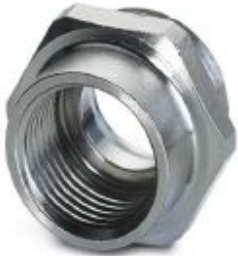
M12 female connector, front mounting SMD with M14 screw fastening

Please be informed that the data shown in this PDF Document is generated from our Online Catalog. Please find the complete data in the user's documentation. Our General Terms of Use for Downloads are valid ( http://phoenixcontact.com/download )