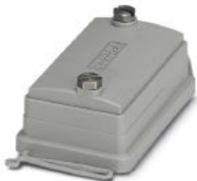
HEAVYCON ADVANCE, IP66, B6 protective cover for panel mounting side, with screw locking, with retaining cord, diameter of retaining cord eyelet: 3 mm

Please be informed that the data shown in this PDF Document is generated from our Online Catalog. Please find the complete data in the user's documentation. Our General Terms of Use for Downloads are valid ( http://phoenixcontact.com/download )