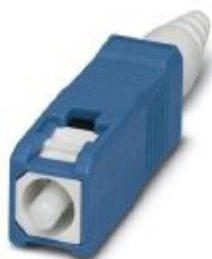
SC connector, with short bend protection (pigtail), for single mode 9/125 µm, PC polishing, blue

Please be informed that the data shown in this PDF Document is generated from our Online Catalog. Please find the complete data in the user's documentation. Our General Terms of Use for Downloads are valid ( http://phoenixcontact.com/download )