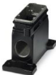
HEAVYCON B6 box mounting base, for screw locking, HPR series, with 2 x M25 gland, for increased environmental and EMC requirements

Please be informed that the data shown in this PDF Document is generated from our Online Catalog. Please find the complete data in the user's documentation. Our General Terms of Use for Downloads are valid ( http://phoenixcontact.com/download )