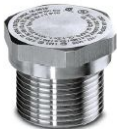
Screw plug, cable gland material: Stainless steel 316L, application: Ex, connecting thread: M32 x 1.5, color: silver

Please be informed that the data shown in this PDF Document is generated from our Online Catalog. Please find the complete data in the user's documentation. Our General Terms of Use for Downloads are valid ( http://phoenixcontact.com/download )