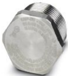
Screw plug, cable gland material: Nickel-plated brass, application: Ex, connecting thread: M32 x 1.5, color: silver

Please be informed that the data shown in this PDF Document is generated from our Online Catalog. Please find the complete data in the user's documentation. Our General Terms of Use for Downloads are valid ( http://phoenixcontact.com/download )