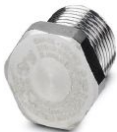
Screw plug, cable gland material: Nickel-plated brass, application: Ex, connecting thread: M20 x 1.5, color: silver

Please be informed that the data shown in this PDF Document is generated from our Online Catalog. Please find the complete data in the user's documentation. Our General Terms of Use for Downloads are valid ( http://phoenixcontact.com/download )