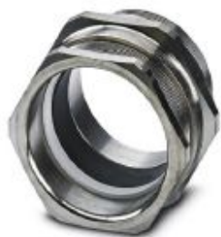
Cable gland, cable gland material: Nickel-plated brass, application: Ex, external cable diameter 35.6 mm ... 44.1 mm, shielding: no, connecting thread: M50 x 1.5, color: silver

Please be informed that the data shown in this PDF Document is generated from our Online Catalog. Please find the complete data in the user's documentation. Our General Terms of Use for Downloads are valid ( http://phoenixcontact.com/download )