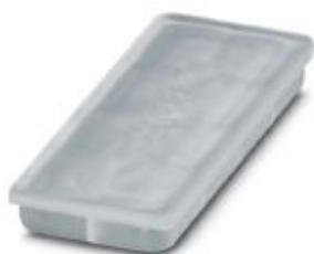
Coated protective cover for the housing on the motor side

Please be informed that the data shown in this PDF Document is generated from our Online Catalog. Please find the complete data in the user's documentation. Our General Terms of Use for Downloads are valid ( http://phoenixcontact.com/download )