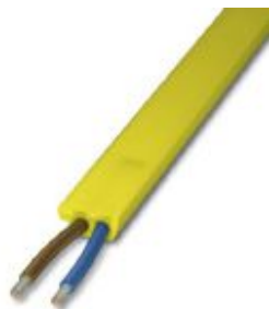
AS-Interface PUR flat-ribbon conductor in yellow, 2 x 1.5 mm 2 , 1000 m on a disposable drum

Please be informed that the data shown in this PDF Document is generated from our Online Catalog. Please find the complete data in the user's documentation. Our General Terms of Use for Downloads are valid ( http://phoenixcontact.com/download )