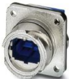
SC-RJ panel mounting frame, IP67, for bayonet locking, metal, with coupling for single mode, SC-RJ to SC-RJ, for round mounting cutout, with seal, without mounting screws

Please be informed that the data shown in this PDF Document is generated from our Online Catalog. Please find the complete data in the user's documentation. Our General Terms of Use for Downloads are valid ( http://phoenixcontact.com/download )