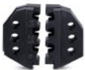
Spare die for CRIMPFOX-SC 6

Replacement die - CRIMPFOX-SC 6/DIE - 1212051