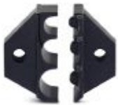
Spare die for CRIMPFOX-RC 25

Replacement die - CRIMPFOX-RC 25/DIE - 1212299