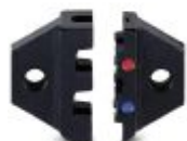
Spare die for CRIMPFOX-RCI 2,5

Replacement die - CRIMPFOX-RCI 2,5/DIE - 1212054